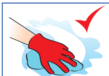
Cleaning and Disinfecting