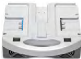
i-charge 9 (3 pieces)