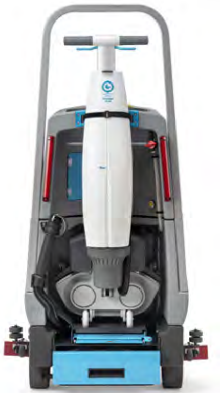
i-drive + imop Lite