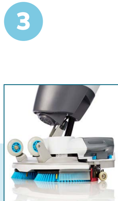
Splash guards Say goodbye to splashing

Knob colors: Black (i-mop Basic), Blue (i-mop Plus), Silver (i-mop Pro)