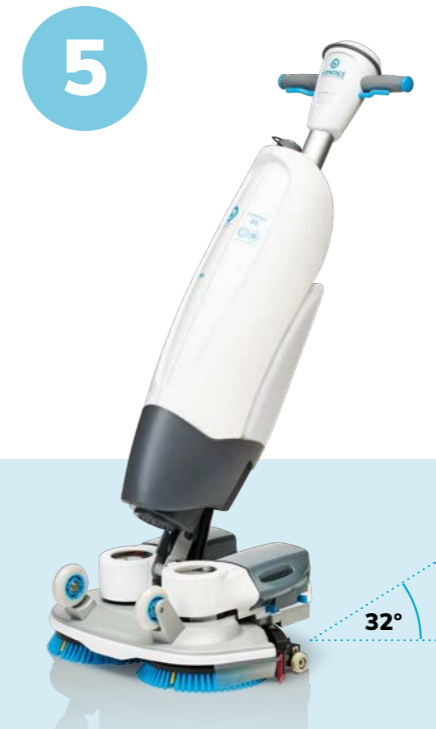
Electronic switch Because you really don't want a flooded motor

There's a floating ball valve in the recovery tank filter system of all new i-mops. This feature (a) automatically closes the tank to prevent water from overflowing and (b) immediately stops the i-mop from extracting fluids from the floor.