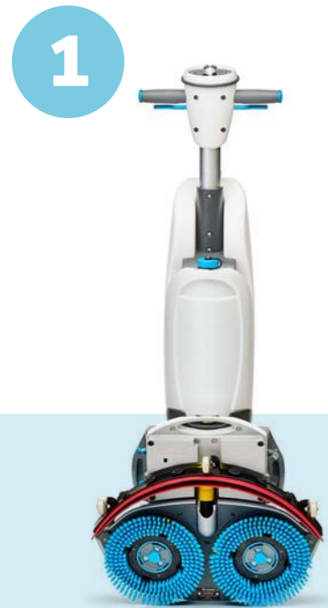
Battery safety guard No more drained batteries

Raising the scrub deck into the Park position will automatically shut off the battery of the i-mop to prevent battery drainage and optimize battery life. Lower the deck to working position, and the battery automatically switches back on.