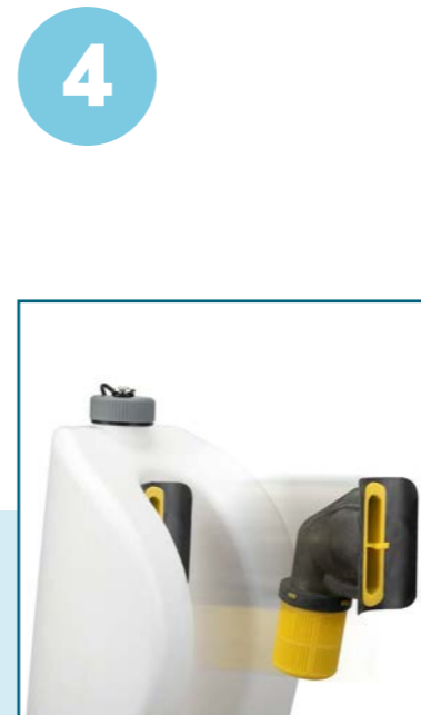
Floating ball system I'll keep my eye on the ball

With the automatic battery shut-off, brushes stop rotating when the unit is put in the upright (parked) position to wheel from one place to another. This prevents splashing against people walking by and undoing your cleaning. And even when the i-mop is in working mode, splash guards on both sides of the deck prevent water from splashing.