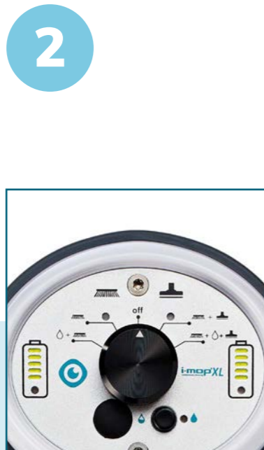
Control panel You can control me

Raising the scrub deck into the Park position will automatically shut off the battery of the i-mop to prevent battery drainage and optimize battery life. Lower the deck to working position, and the battery automatically switches back on.