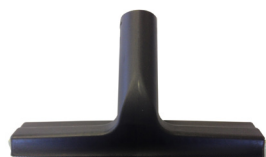
250mm Glass Washer