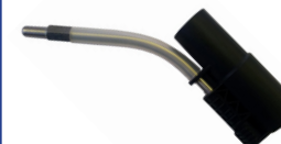
Short Steam Lance