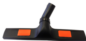
300mm Floor Nozzle