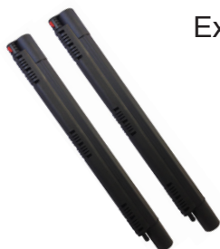
Extension Tubes x 2 supplied with each machine