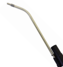
Long Steam Lance