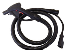
2.5 Metre Steam, Detergent & Vacuum Hose