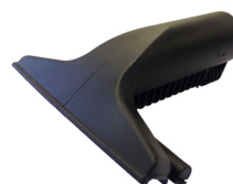
150mm Steam & Vacuum Brush Nozzle