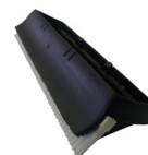
Clip On Squeegee 15RM00042